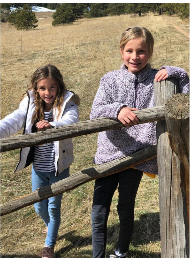
"Life should not be a journey to the grave with the intention of arriving safely in a pretty and well-preserved body, but rather to skid in broadside in a cloud of smoke, thoroughly used up, totally worn out, and loudly proclaiming "Wow! What a Ride!"