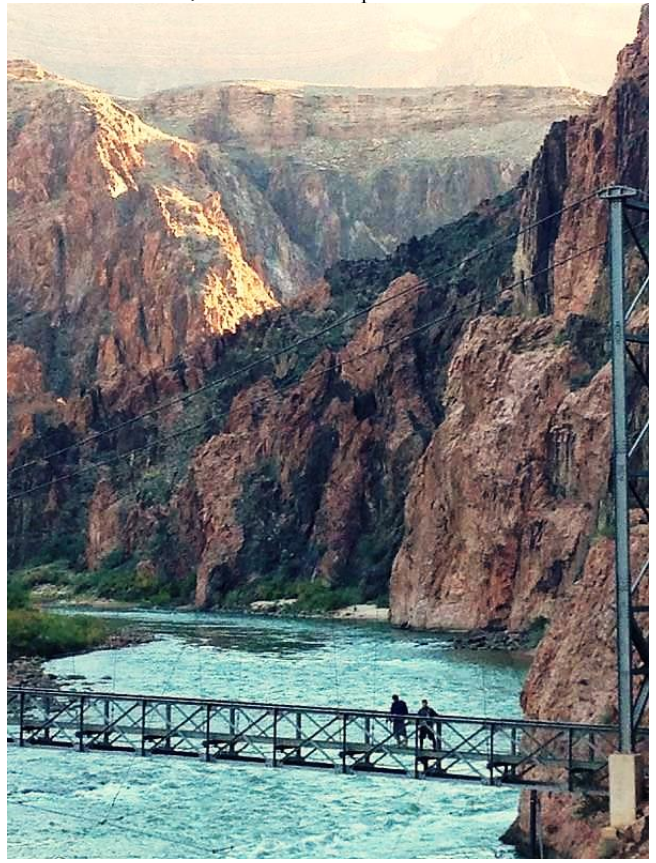
Kris and Garry at the Bright Angel Trail bridge over the Colorado River in the Grand Canyon

The hikers really picked up the pace as they trekked along the scenic canyon floor. Looking at the canyon walls you can't help but notice the beautiful sequence of rock layers that serve as a window into time. The Grand Canyon is 277 miles long, 18 miles wide at its widest point and one mile deep. As the trail began to ascend up the north rim, Kris' knee continued to worsen. He kept telling himself, "If you don't mind, it don't matter." The north rim is absolutely beautiful and unrelenting. After a while, switchbacks seemed endless. Garry began to question his conditioning. The typical self-talk — "no problem, we're just walking" — seemed to fade and overwhelming thoughts of doubt subjugated the mind. As they neared the summit, the rugged red landscape gave way to a diverse forest of spruce, fir and aspens. Once on top of the north rim, the friends needed to make a decision — continue, and Kris would have to sidestep his way down the north rim and risk injury and Garry would have to summon miraculous strength to endure another 20+ miles of trail, or take a 4.5 hour shuttle ride back to the south rim. They decided to end the journey after 23.5 miles and return via the shuttle. It was an incredible, bittersweet experience and the memories will last a lifetime!